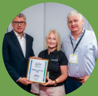
SUPPLIER OF THE YEAR

The New Product New Plants awards and Supplier of the Year Awards showcase takes centre stage at GLAS, all entrants are showcased at the event and all exhibitors are encouraged to take part. A panel of expert judges choose the winners who are announced at a special awards presentation at the show and on Growtrade.ie.