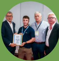
BEST IN SHOW TRADE SUPPLIER OF THE YEAR