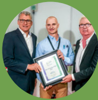
BEST NEW PRODUCT/PLANT OF THE YEAR