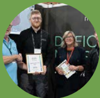
SUPPLIER OF THE YEAR

The New Product New Plants awards and Supplier of the Year Awards showcase takes centre stage at GLAS, all entrants are showcased at the event and all exhibitors are encouraged to take part. A panel of expert judges choose the winners who are announced at a special awards presentation at the show and on Growtrade.ie.